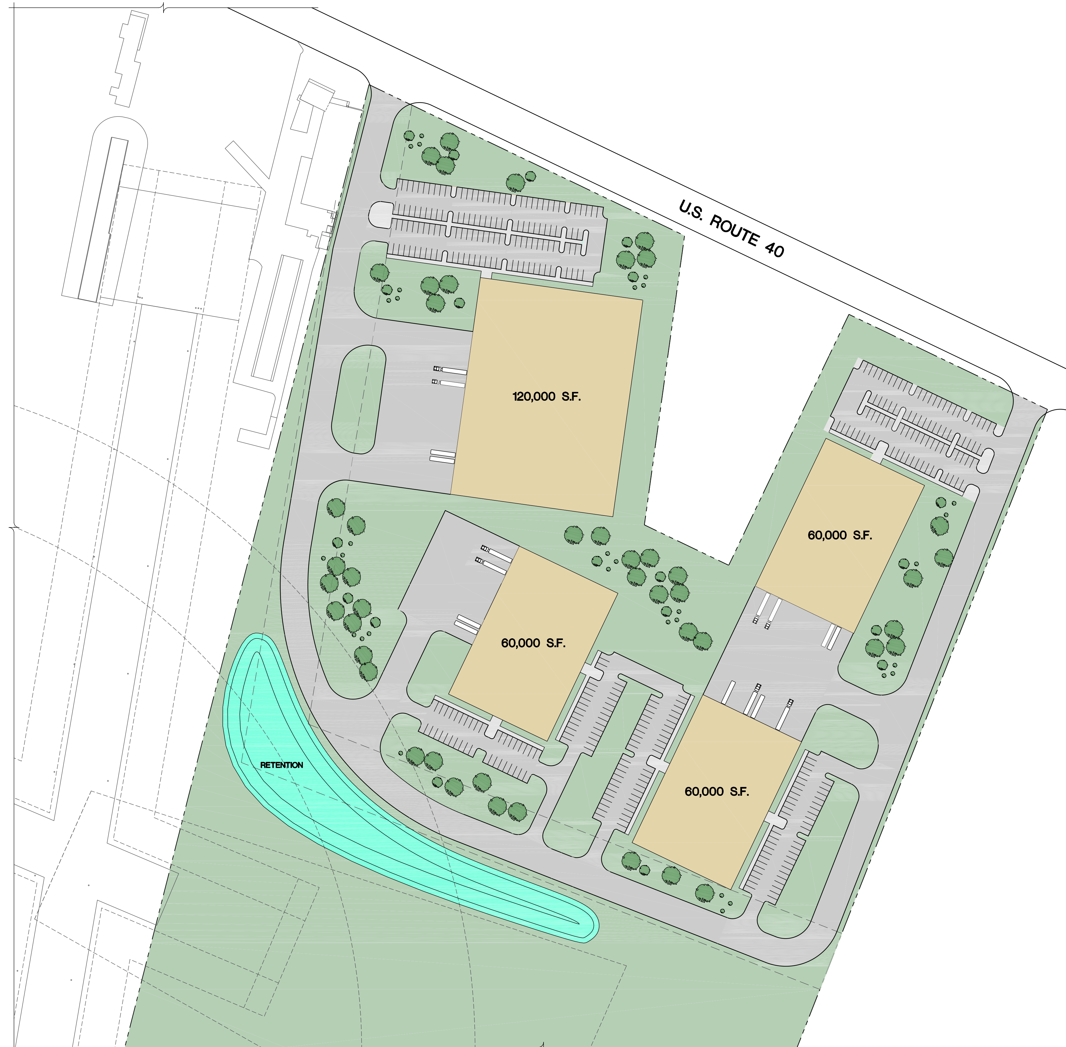
SITE PLAN SCALE: 1" = 100'-0"